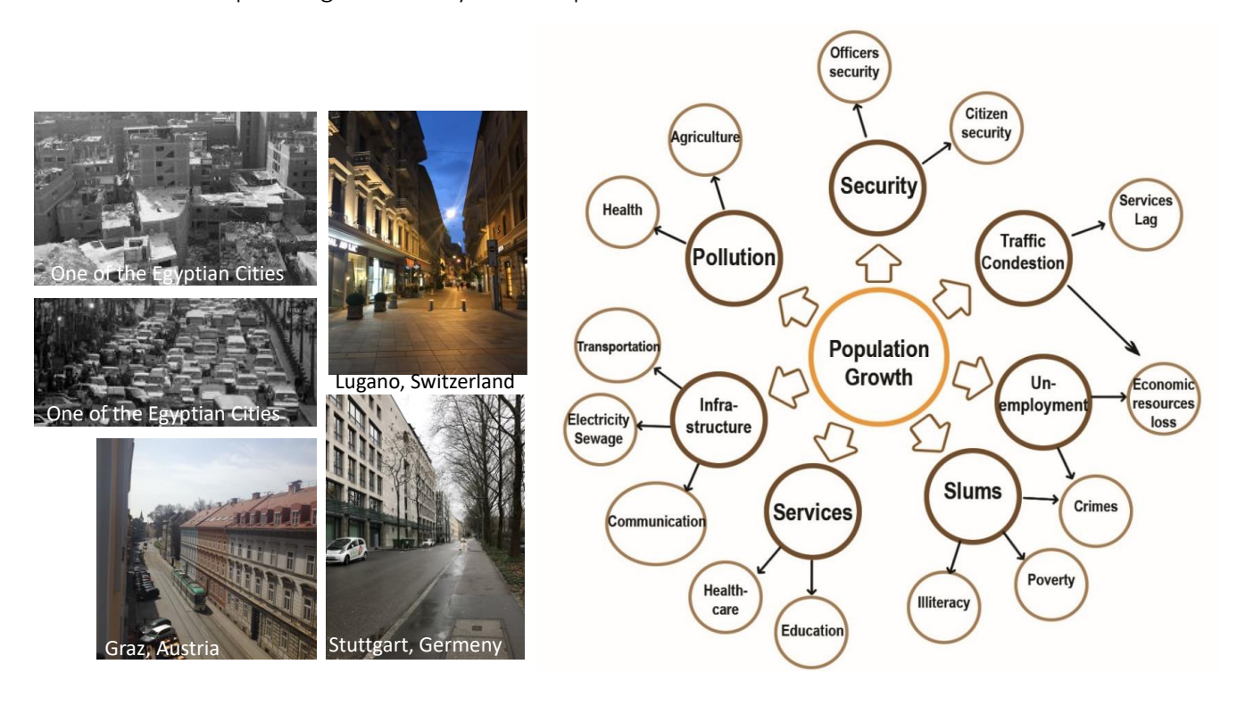
Figure 1. Images showing comparison between city-districts in Egypt and others in Europe (left) and schematic showing challenges of urbanization (right)

Most important, the number of research manuscripts generated from Egyptian universities and research centres on urban planning is relatively low compared to other areas.